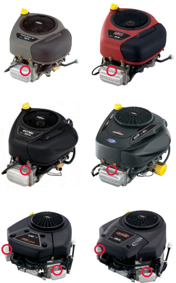
Power Built™ Series, I/C® Series™, Intek™ Series™, Extended Life Series®