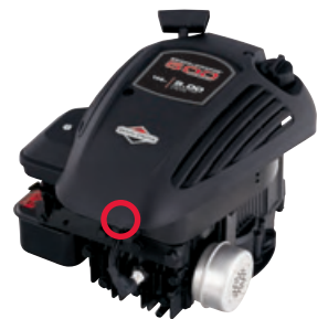
400 Series™, 500 Series™ Classic™, Sprint™, SO™, Q™