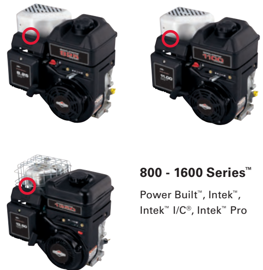
800 - 1600 Series™

Power Built™, Intek™, Intek™ I/C®, Intek™ Pro