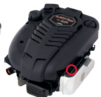
600 Series™, 800 Series™ Quantum®, Intek™